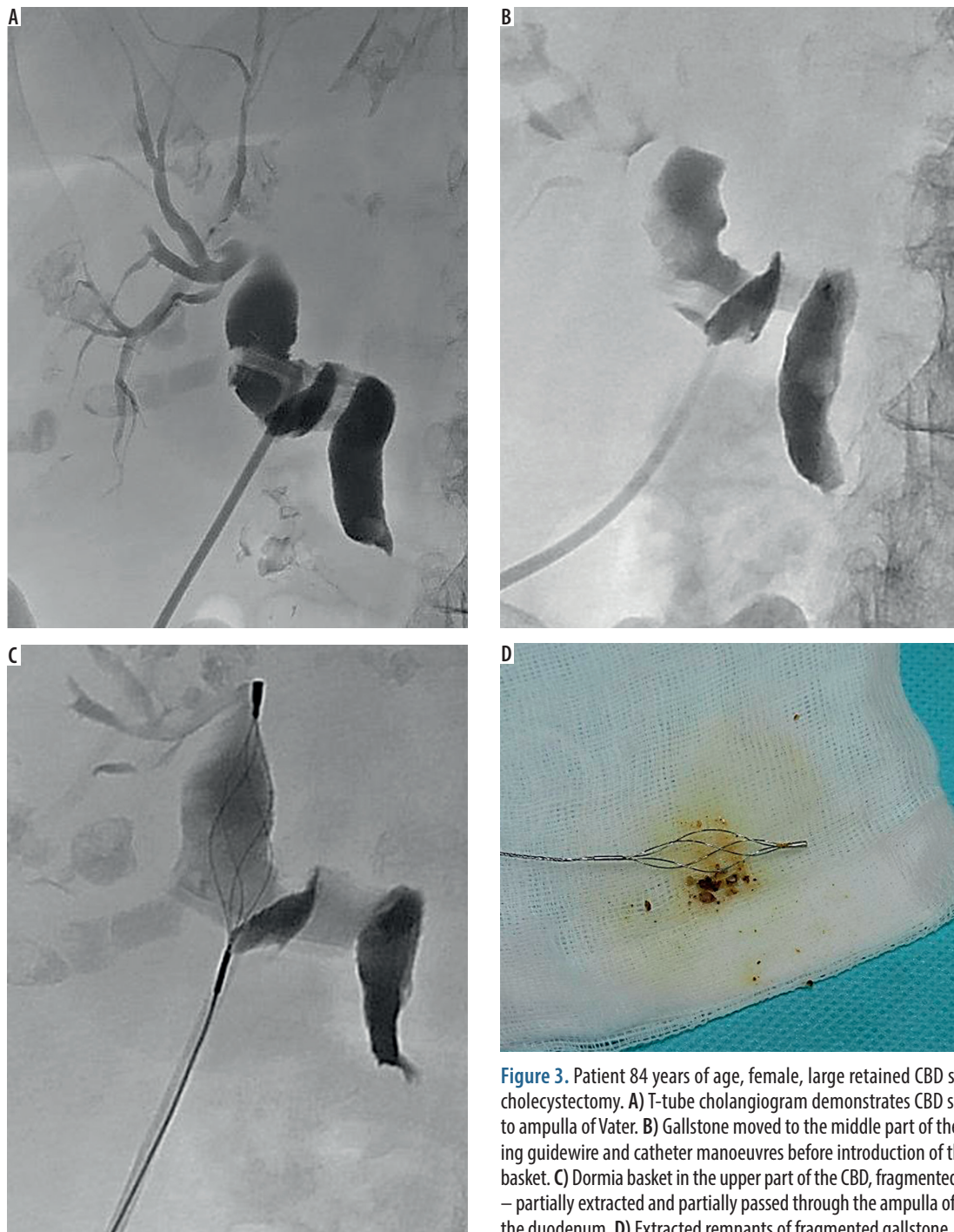
Figure 3. Patient 84 years of age, female, large retained CBD stone after cholecystectomy. A) T-tube cholangiogram demonstrates CBD stone close to ampulla of Vater. B) Gallstone moved to the middle part of the CBD during guidewire and catheter manoeuvres before introduction of the Dormia basket. C) Dormia basket in the upper part of the CBD, fragmented gallstone – partially extracted and partially passed through the ampulla of Vater into the duodenum. D) Extracted remnants of fragmented gallstone

deposits can be removed using balloon catheters – baskets (spiral, flowery, Dormia) [16]. The effectiveness of this procedure in clinical trials is 80-99% and clearly depends on the operator's experience [17,18]. The complications of endoscopic papillotomy include pancreatitis, cholangitis, sepsis, perforation, bleeding, and impaction of the basket; according to the literature data, their incidence is 8% [19,20]. The contraindications for endoscopic papillotomy include: duodenal diverticulosis, duodenal constriction, anatomical anomalies, and advanced age of patients [7].